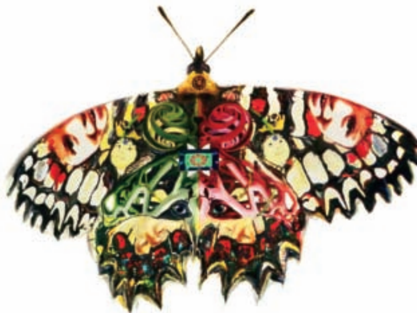
Ayahuasca + Chagro Oil on Canvas and 3D Animation, 71 x 59 inches. 2013 Alex Sastoque

Sastoque is unique amongst the exhibiting artists insofar as his body of work extends beyond oil on canvas. In 2007,