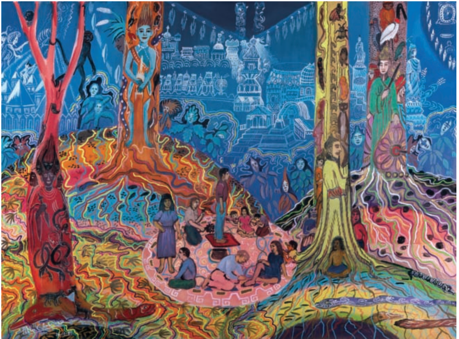
Vision 30: Kapukiri Gouache on paper, 18 x 24 inches, 1988 Pablo Amaringo