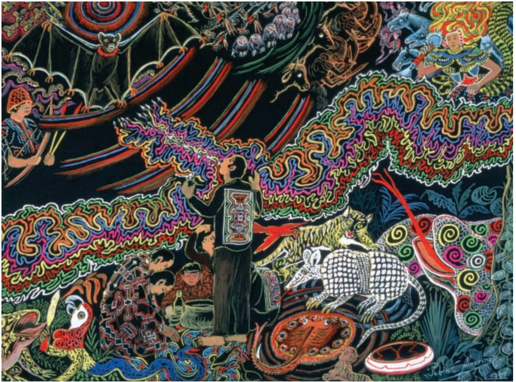
Vision 43: Fight Between a Shipibo and a Shetebo Shaman Gouache on paper, 12 x 16 inches. 1987 Pablo Amaringo