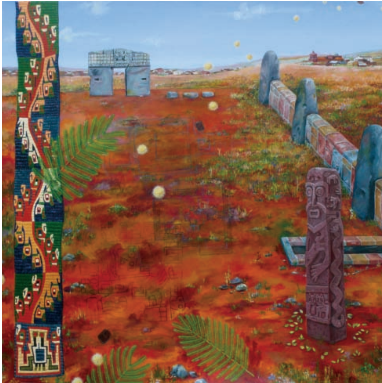
Unpacking History Oil on Linen, 40 x 40 inches. 2005 Donna Torres