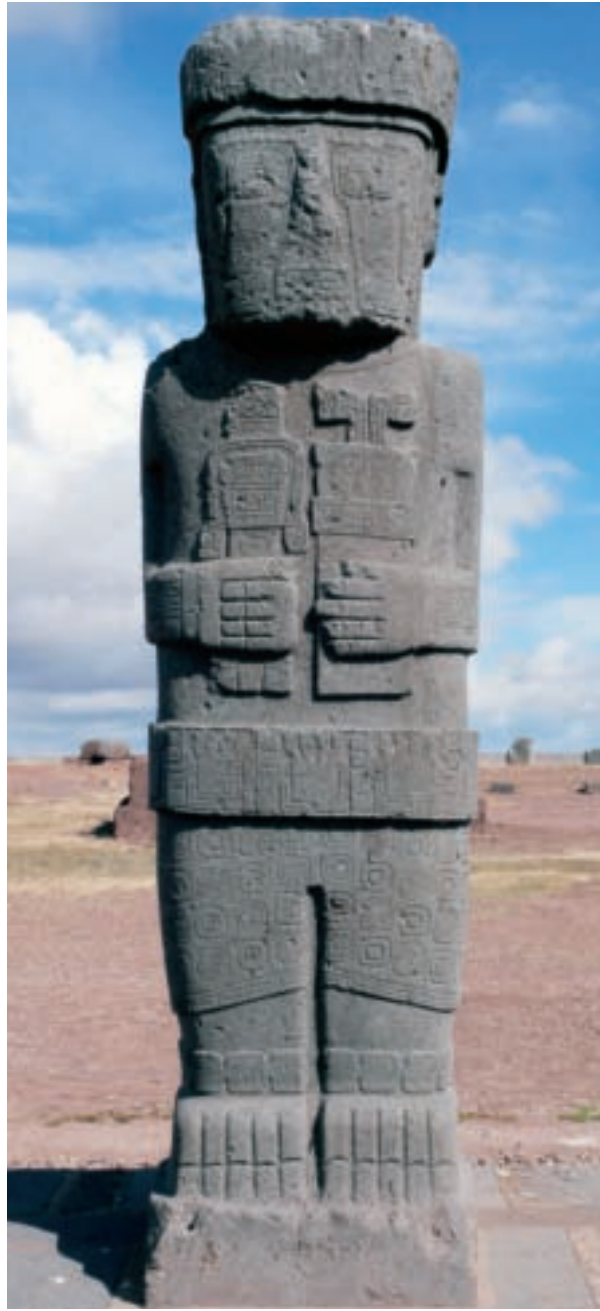
Figure 3. The “Ponce Monolith”, In the Ponce Stela at the Kalasasaya Courtyard, Bolivia, South America.

100 AD) and Colima (100 AD) in Mexico. Although persecuted by the religious and civil authorities of Mexico since the 16th century, peyote is still the central sacrament of the Huichol, Cora and Taramara of that country. In the US, the American Indian sacramental use of peyote was threatened in 1990 by an ominous decision of the Supreme Court, in response to which the Native American Church (NAC), seeking protection of the ancient use of peyote, prevailed on Congress to enact in 1993 the Religious Freedom Restoration Act (RFRA), and to amend in 1994 the American Indian Religious Freedom Act (AIRFA), both signed into law by President Clinton, to ensure the continued religious use of peyote by thousands of members of the Native American Church.