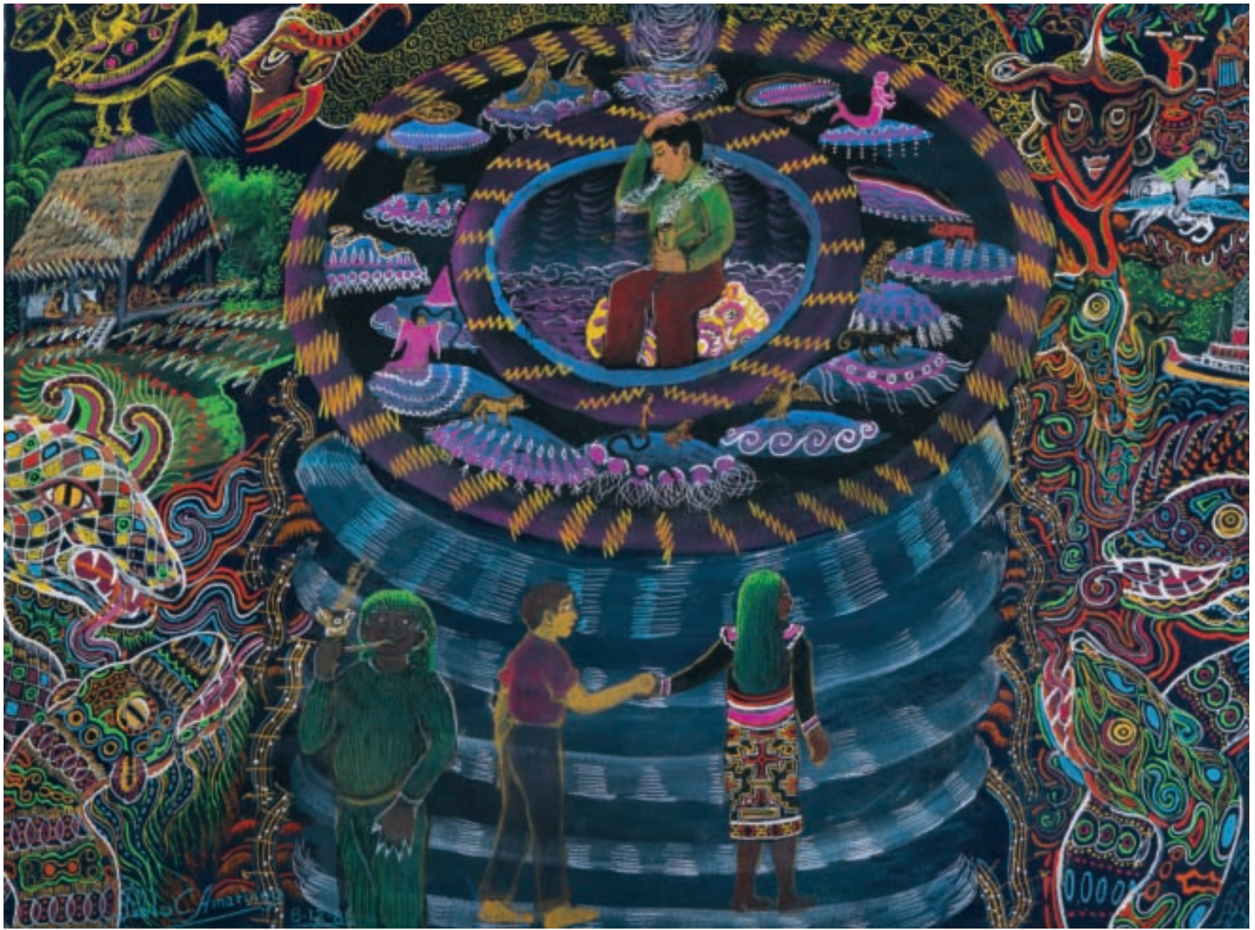
Vision 39: Recovering a Young Man Kidnapped by a Yaruruna Gouache on paper, 12 x 16 inches. 1986 Pablo Amaringo