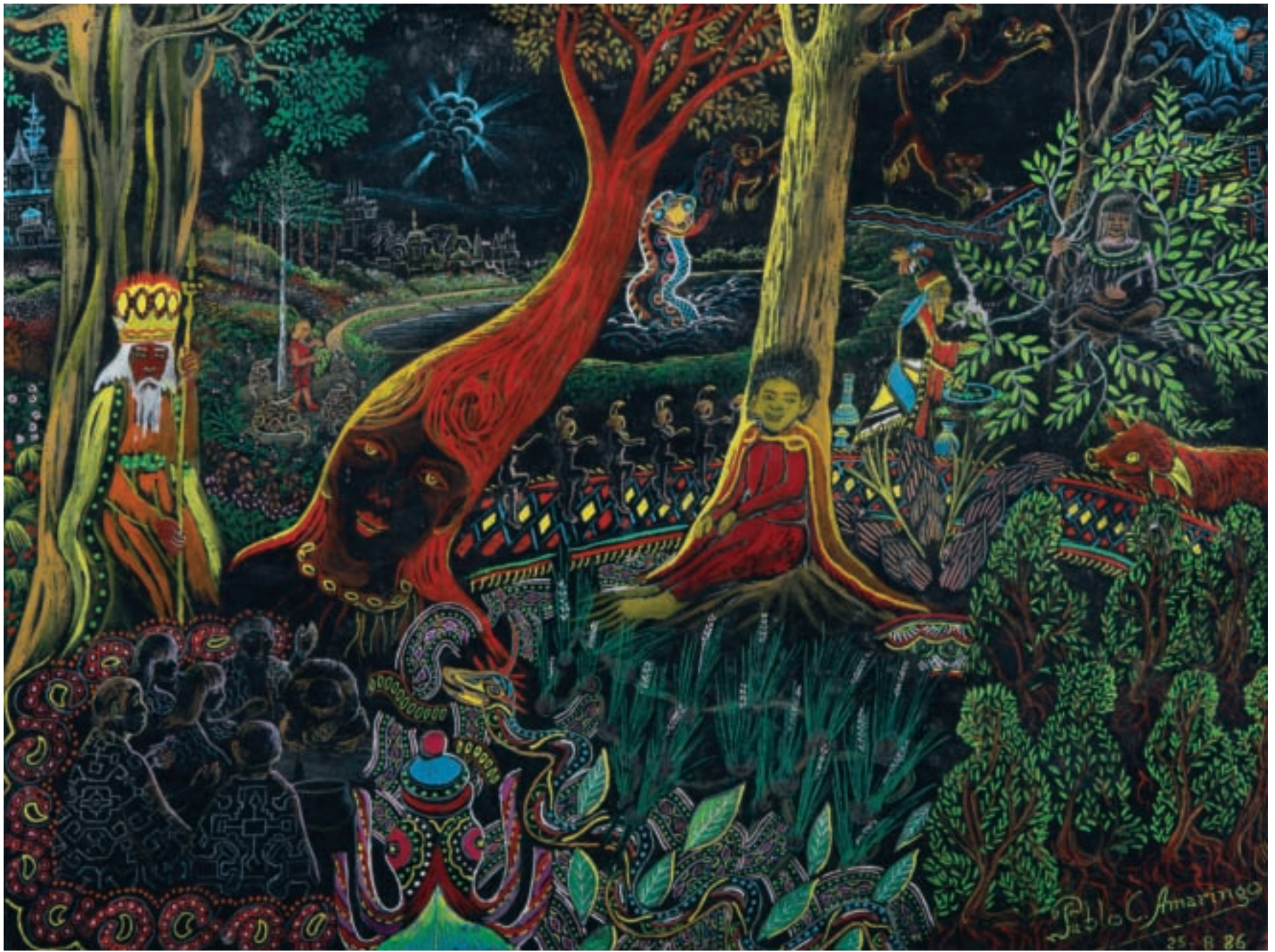
Vision 4: The Spirits or Mothers of the Plants Gouache on paper, 12 x 16 inches. 1986 Pablo Amaringo