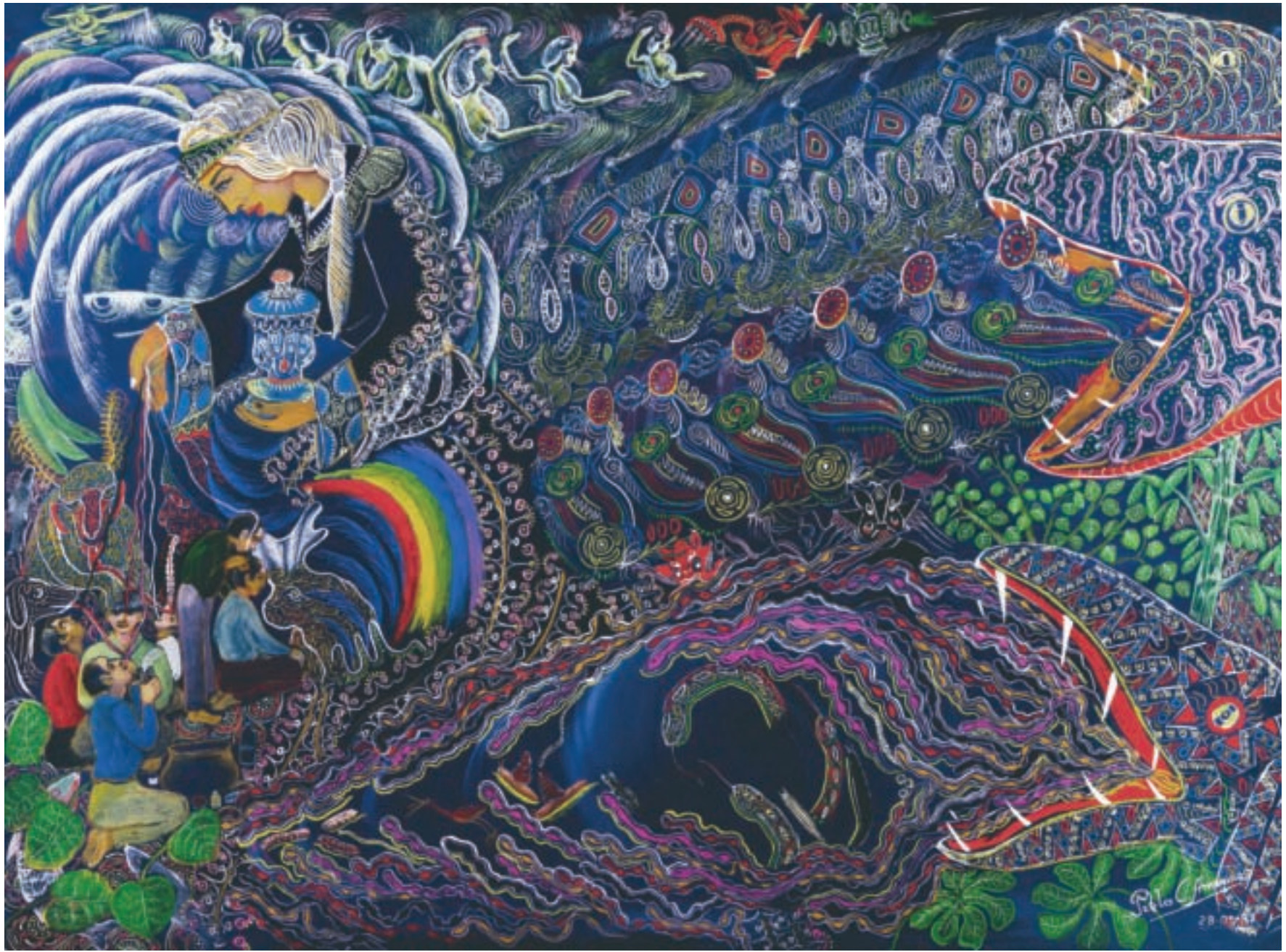
Vision 8: The Powers of the Mariris Gouache on paper, 18 x 24 inches. 1987 Pablo Amaringo