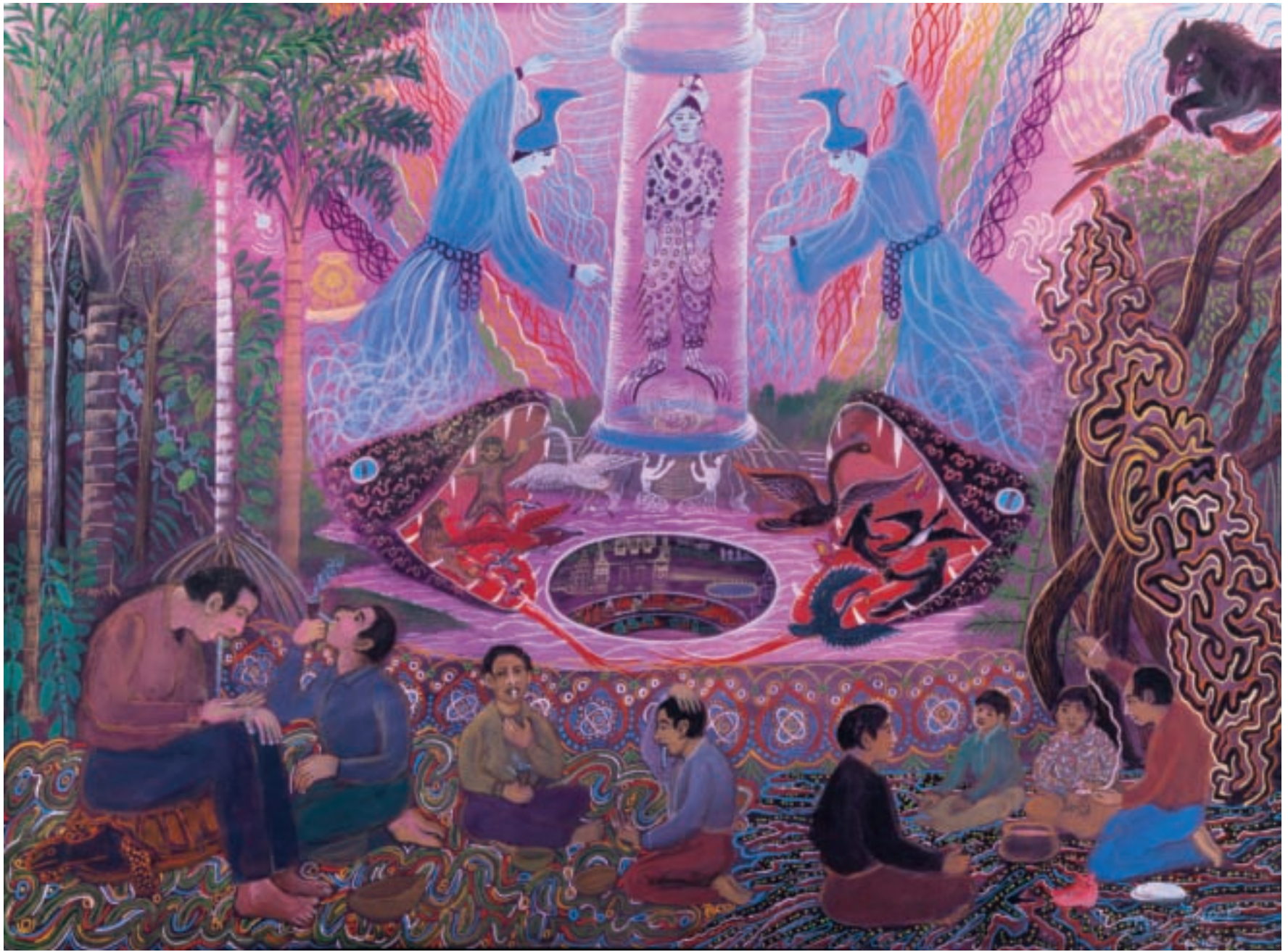
Vision 21: The Sublimity of the Sumiruna Gouache on paper, 18 x 24 inches. 1987 Pablo Amaringo