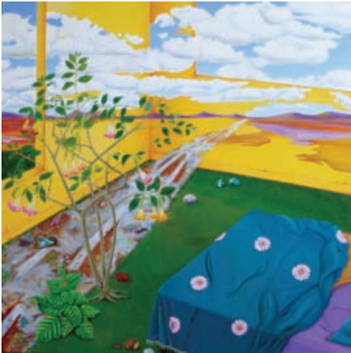
The Travelers Oil on Canvas, 54 x 54 inches. 2006 Donna Torres

elements that they too have encountered.