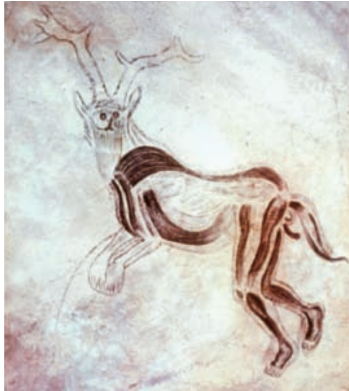
Figure 1. The “Dancing Sorcerer” from the Cave of the Trois-Frères, Ariège, France.