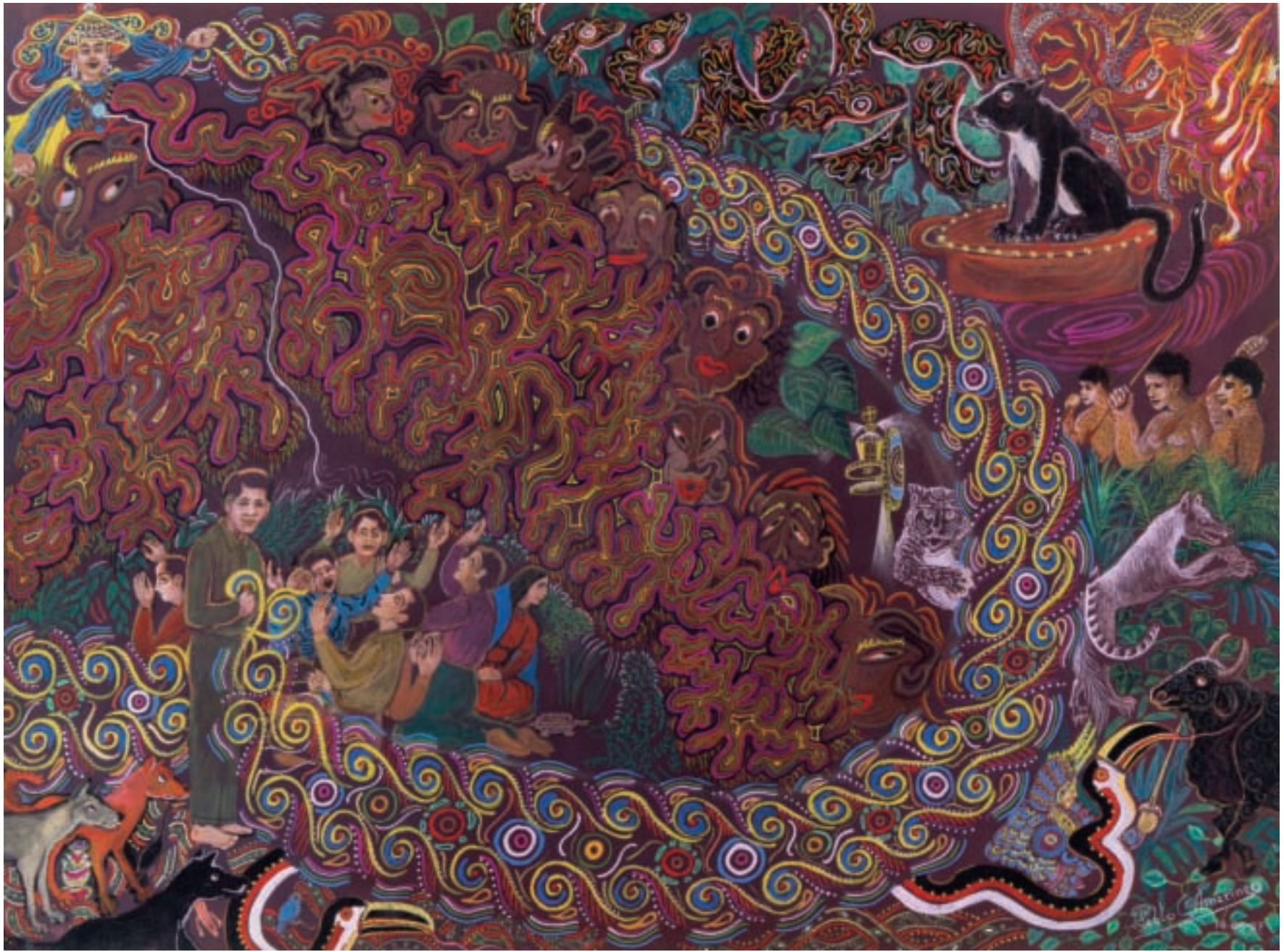
Vision 44: Fighting Through Tingunas Gouache on paper, 18 x 24 inches. 1987 Pablo Amaringo