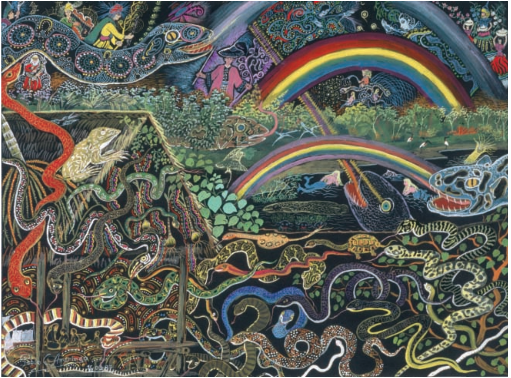
Vision 17: Vision of the Snakes Gouache on paper, 12 x 16 inches. 1987 Pablo Amaringo