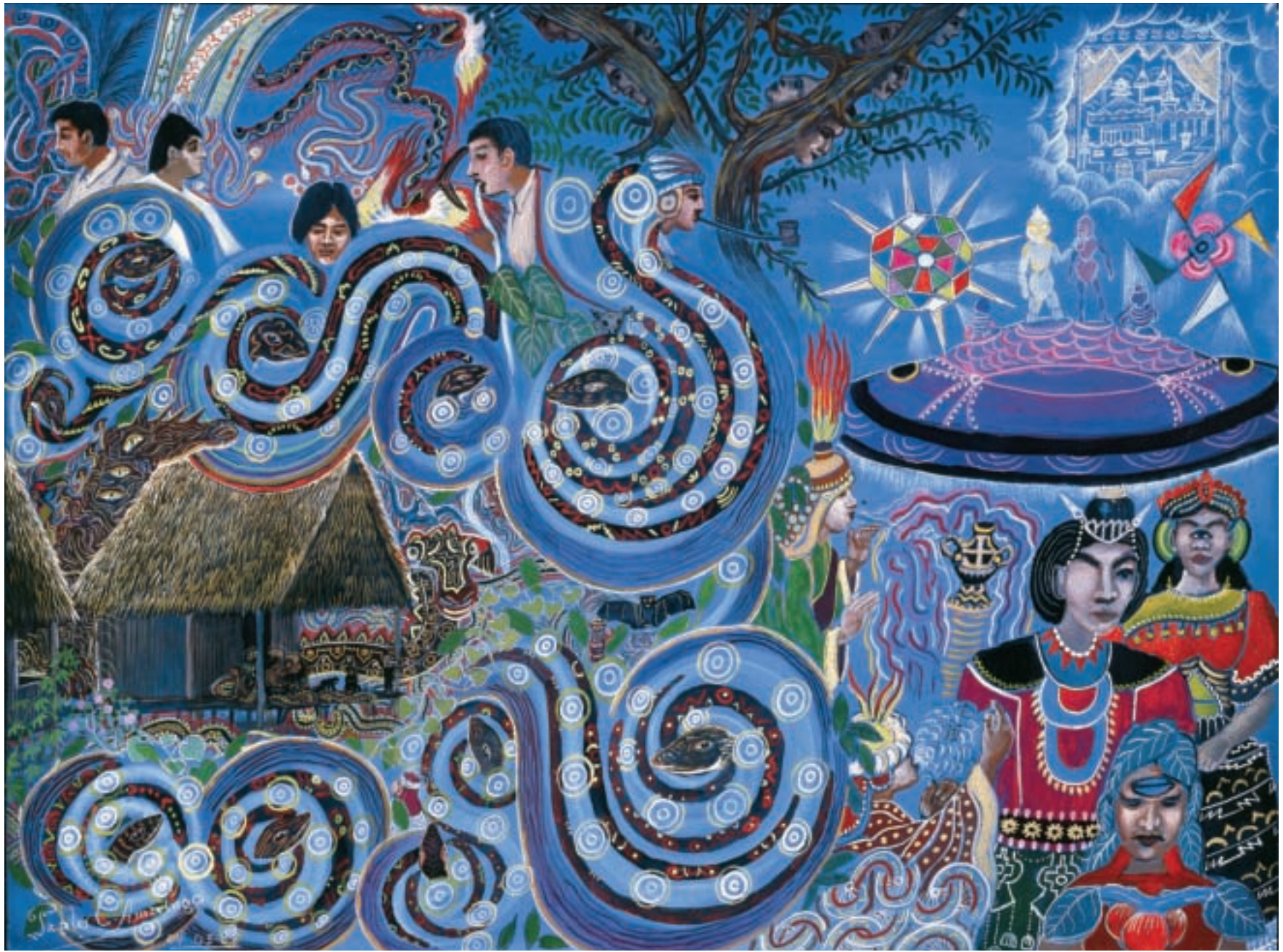
Vision 42: Lucero Ayahuasca Gouache on paper, 18 x 24 inches. 1987 Pablo Amaringo