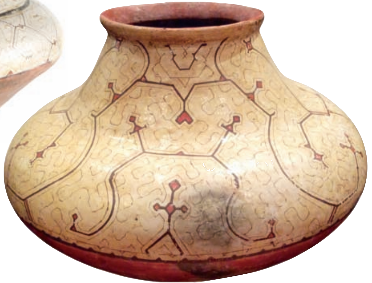
Shipibo Pot Mid-twentieth century Clay and pigments, 17 x 25 x 25 inches Collection of Lawrence and Rachel Kolton