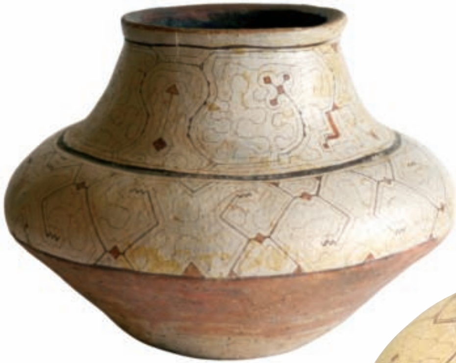
Shipibo Pot Early twentieth century Clay and pigments, 12 x 18 x 18 inches Collection of Craig and Judy Spiering