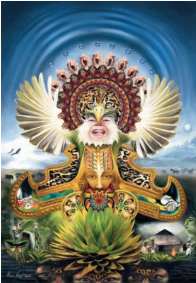
Dawn - Amanecer Oil on Canvas, 27 x 39 inches. 2012 Alex Sastoque