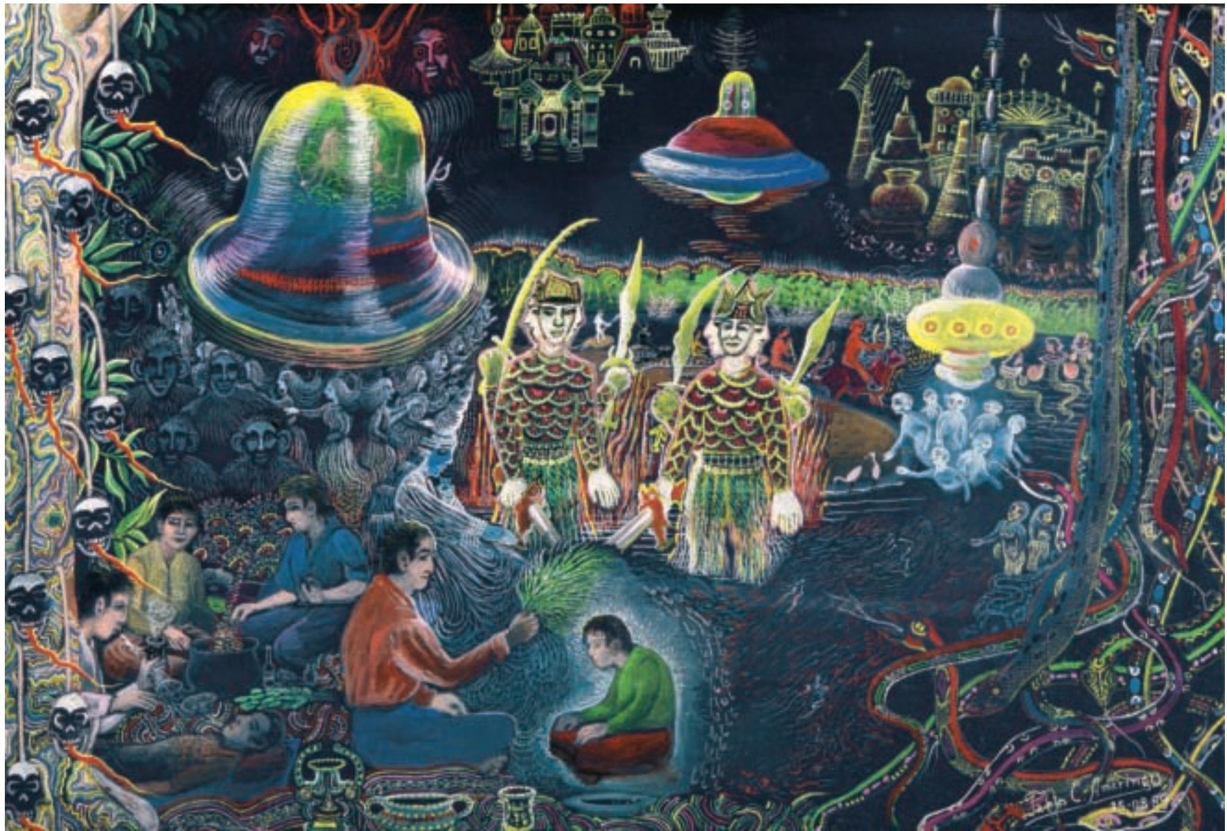
Vision 33: Campana Ayahuasca Gouache on paper, 12 x 18 inches. 1989 Pablo Amaringo