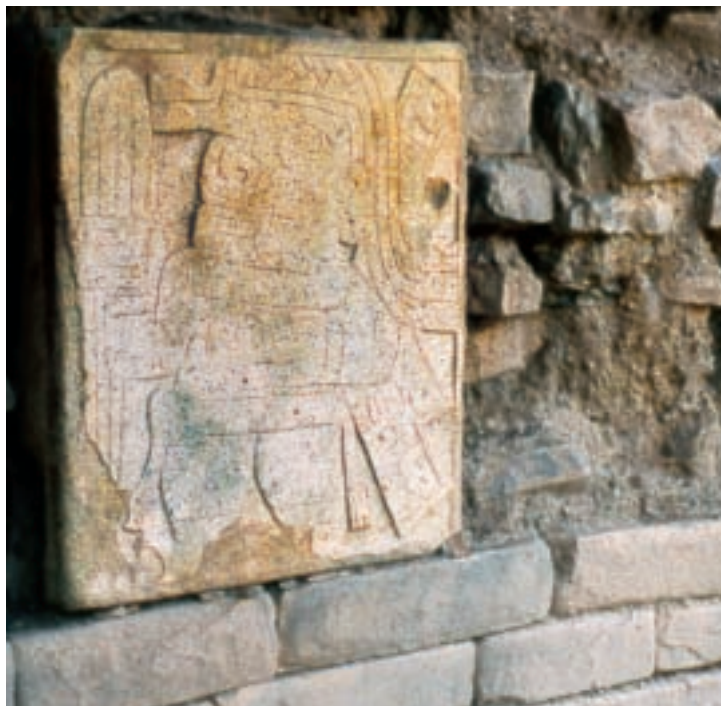
Figure 2. "The Cactusman", plaza of the temple of Chavín de Huántar (1200-300 BCE), Ancash, Peru.

In the circular plaza of the temple of Chavín de Huántar (1200-300 BCE), one of the figures in the gallery of the offerings (Figure 2) is a man-jaguar therianthrope with snakes as hair and a belt holding a piece of Trichocereus pachanoi , the well-known San Pedro cactus still used by healers in Andean and coastal Peru. Chavín ceramic representations of this cactus, either in