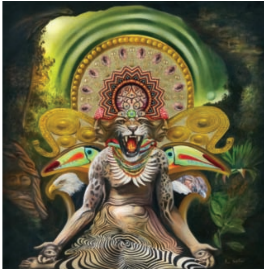
Transformacion chamanica "Hombre Jaguar" Oil on Canvas, 48 x 48 inches. 2012 Alex Sastoque

Alex Sastoque, one of the younger members of this show, has worked directly under the aforementioned Ernst Fuchs, now 84, and has recently collaborated with the master on works of art. Sastoque’s narrative is directly influenced by shamanism and, much like the supernatural found in the Vienna School of Fantastic Realism, Sastoque focuses squarely on supernatural entities. His latest compositions are often symmetrical with an ethereal lighting and setting. It is in the lighting and overall color palette where the Old Master’s and Fuchs’s influence