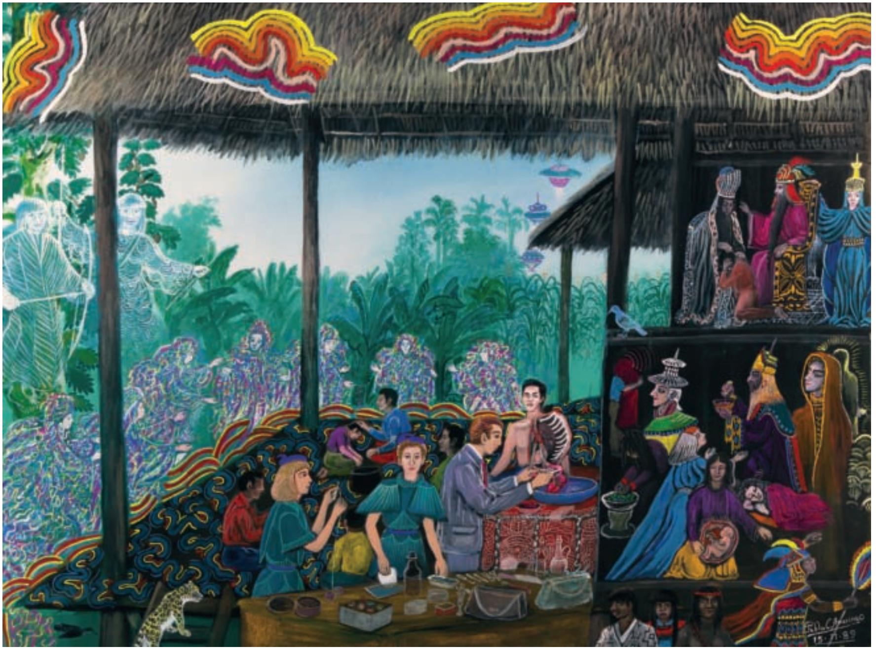
Vision 28: Spiritual Heart Operation Gouache on paper, 12 x 16 inches, 1989 Pablo Amaringo