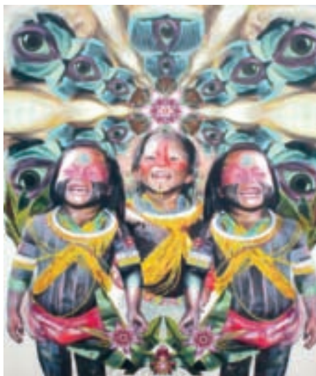
Happiness in a Trance Oil on Canvas, 71 x 59 inches. 2013 Alex Sastoque

as a sacred image as it is a healing picture, visual medicine is a plane parallel to this painting” (53).