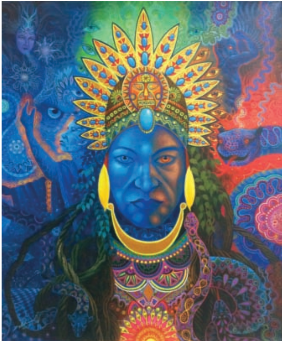
Visionary Inca Oil on Canvas, 17 ¾ x 19 ¾ inches. 2012 Anderson Debernardi